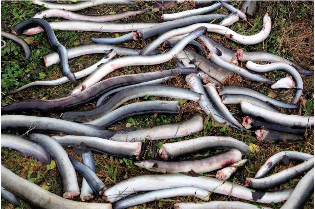
Eels killed by hydropower turbines during their natural downstream migration.