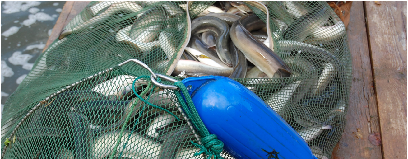
Eels have been saved in one night from being killed in hydropower turbines during their natural downstream migration. State of the art fish protection for small hydropower has been available for many years. It is the will for implementation that is lacking.

Stopping all fisheries is often communicated as the prime and most logical priority when dealing with declining migratory fish. It is certainly not. Fisheries need to be regulated and controlled but will not make a difference if other factors such as hydropower turbine-induced mortality, habitat loss and blocked migration pathways remain unattended. Long overdue retrofitting with state-of-the-art technology pumps and turbines could help to protect migratory fish. Goals of European Directives lack in implementation. Therefore, we propose a comprehensive approach that takes into consideration all anthropogenic impacts under an effective enforcement of the Water Framework Directive (Directive 2000/60/EC), the Habitats Directive (Council Directive 92/43/EEC), and the Eel Regulation (Council Regulation (EC) 1100/2017). Fish are normally not visible. Blocked pathways lead to the creeping loss of fish stocks hidden from the public view.